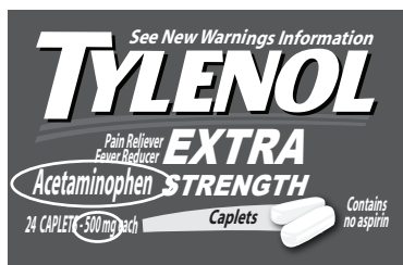
Brand name medicine label for acetaminophen

Isbarbar dhig magacyada dawooyinka si aad u hubiso in dawooyinka astaanta leh iyo dawooyinka magac guud wada leeyihiin maadooyinka firfircoon oo isku mid ah . Maaddooyinka firfircoon waa daawooyinka kujira sheyga ee ka shaqeeya inay daaweeyaan dhibaatadaada. Tusaale ahaan, maadada firfircoon ee acetaminofin, waxaa lagu qoray liiska dawada ee sumadda dawada astaanta iyo dawooyinka guud ee la muujiyey.