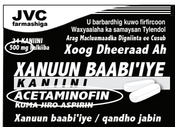
Generic name medicine label for acetaminophen